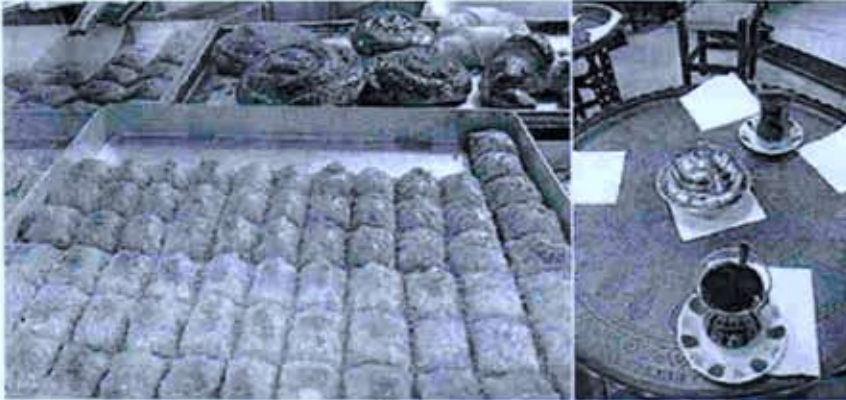
Baklava and traditional pastries