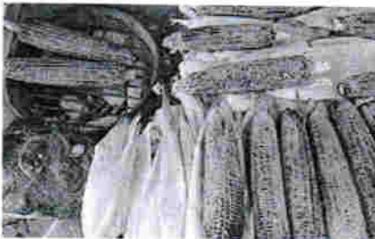
Grilled sweetcorn on the street

For what is quite possibly the best kebab in town, head to Hamdi , located close to the Egyptian bazaar which has a large terrace with views over the Golden Horn.