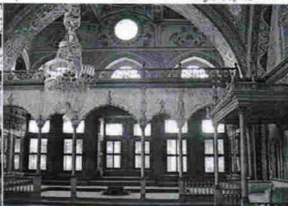
Topkapi Palace harem

The Old Town is great for a slice of history and timelessness. Must-see sites include Hagia Sophia , The Blue Mosque , Soguk Cesme Street , Topkapi Palace and the Basilica Cistern .