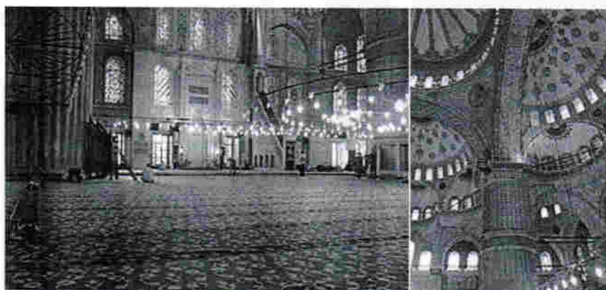
The Blue Mosque

the city reveals the imprint of its history. Built over the ruins of a Byzantium palace, the Great Palace Mosaic Museum in Sultanahmet is worth a visit. Close by, the Istanbul Archeology Museum houses over a million objects from various cultures.