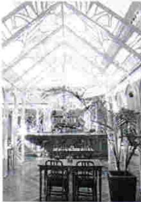
House Café at Istinye Park