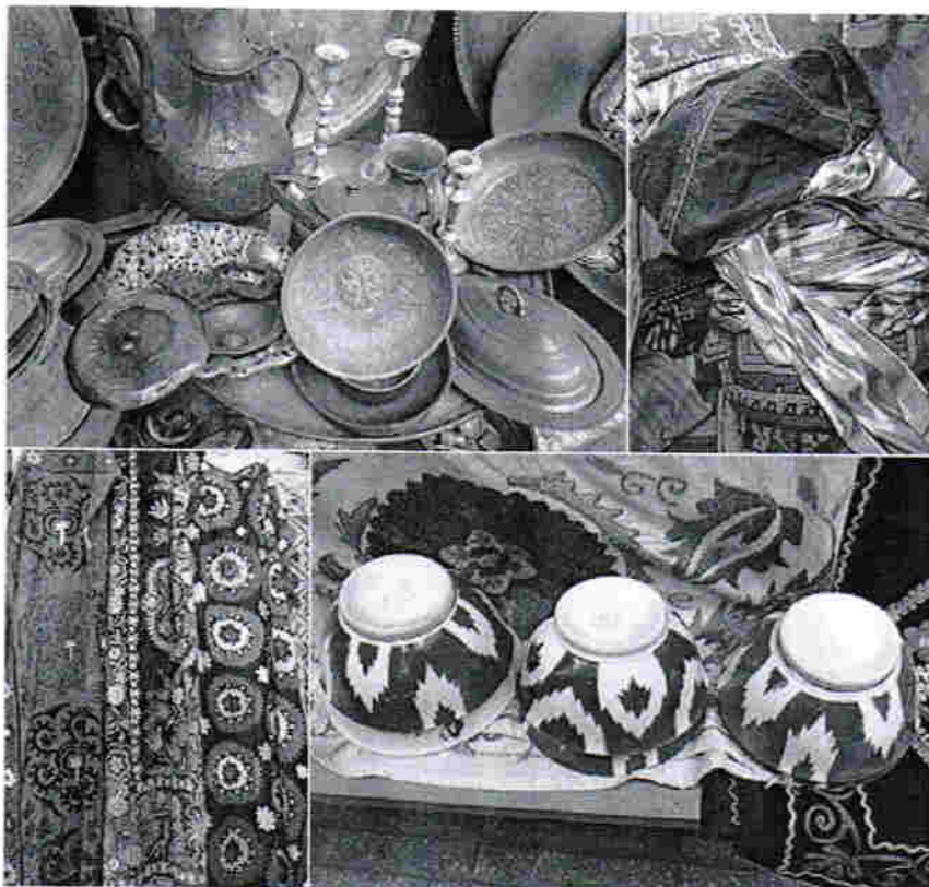
The Grand Bazaar